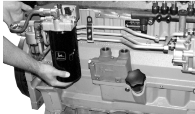
Remove Fuel Filter Assembly (—246269)