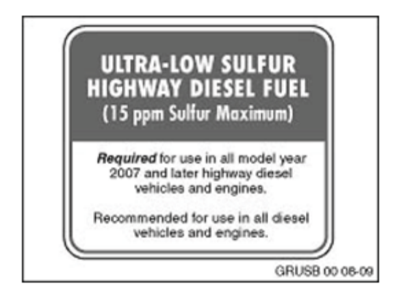
Fig. 4: Identifying Ultra-Low Sulfur Highway Diesel Label

ULSD dispensing pumps are labeled accordingly: