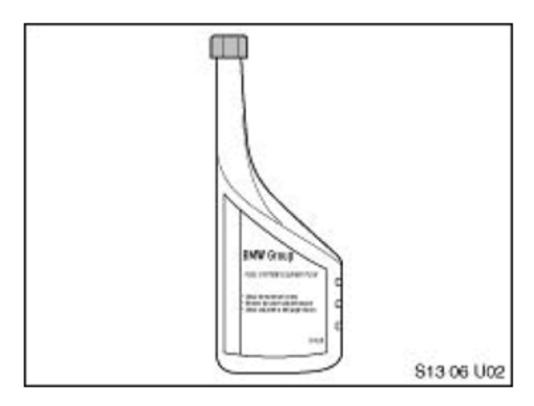
Fig. 1: Identifying BMW Group Fuel System Cleaner Plus Bottle