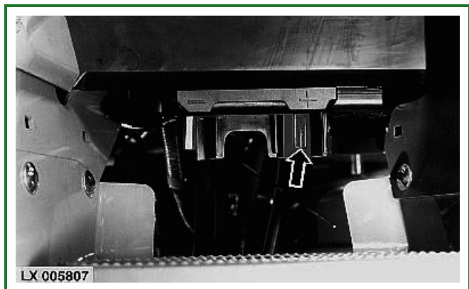
LX005807-UN: Main Fuse Located in Power Distributor

The main fuse is located inside the power distributor. It protects the entire battery circuit (160 A).