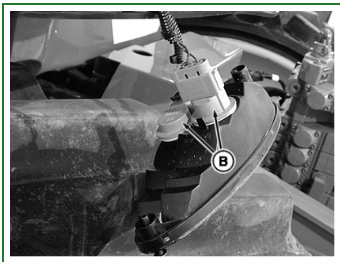
RXA0137102-UN: Remove Light Bulb