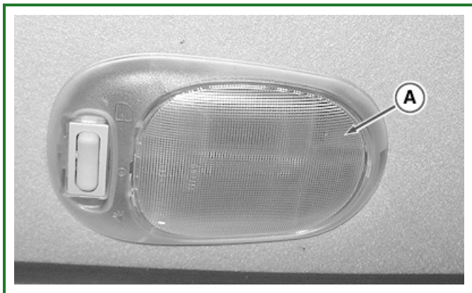
RXA0099130-UN: Remove Cover