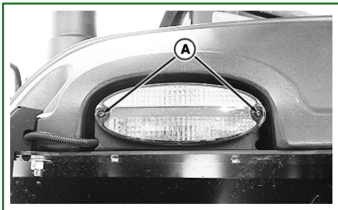
RXA0137101-UN: Remove Light Assembly