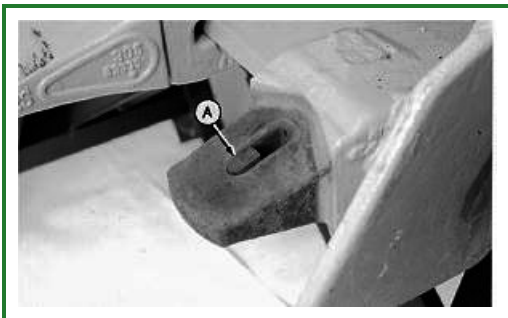
T95785-UN: Rubber Pin Lock