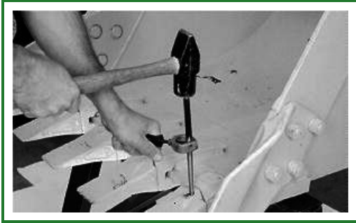
T95784-UN: Bucket Teeth

Use a hammer and drift to drive out locking pin.