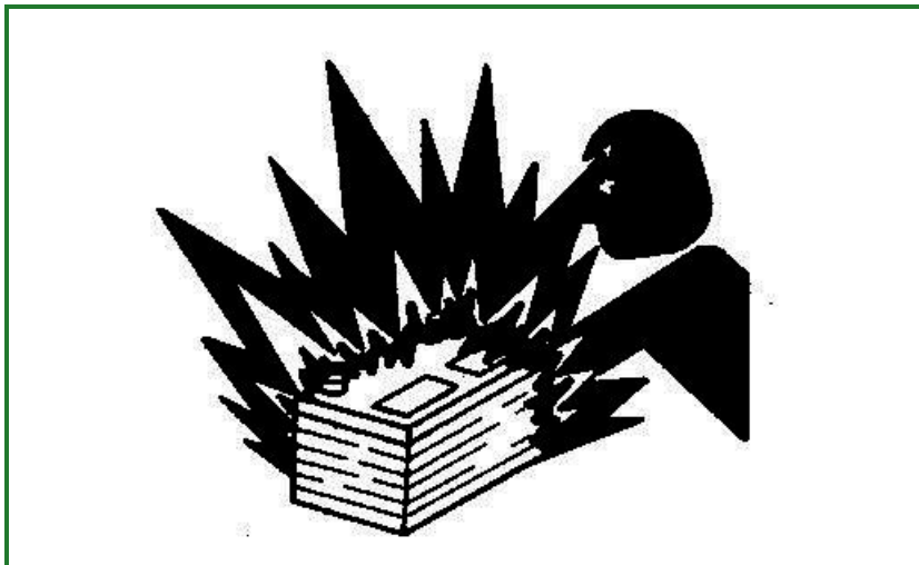
TS204-UN: Prevent Battery Explosions