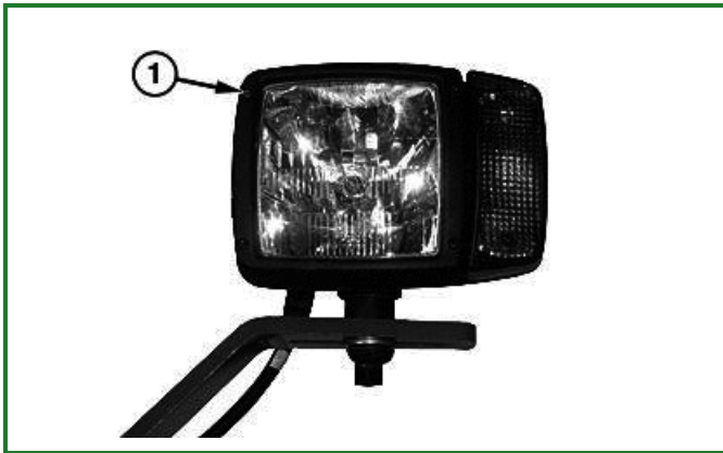
T214510A-UN: Drive Light