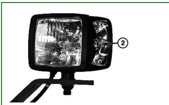
T214513A-UN: Directional Lamp Bulb