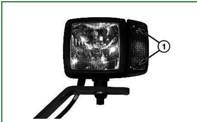
T214511A-UN: Directional Lamp