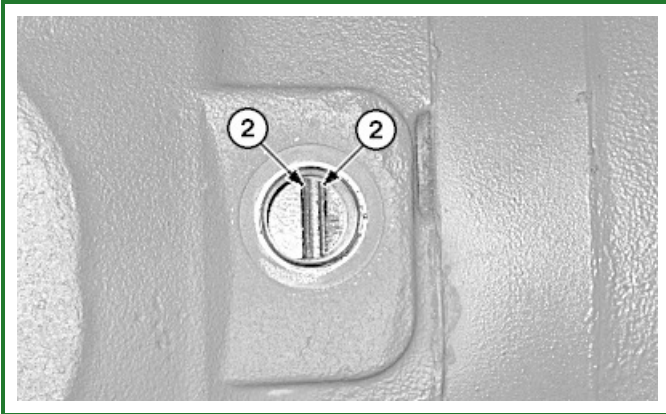
TX1030355A-UN: Brake Disc Linings