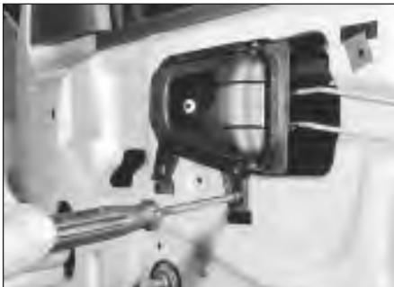
18.3a Remove the securing screws . . .