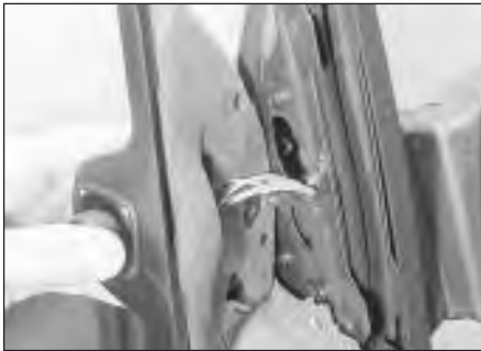
17.12b . . . and withdraw the mirror control panel

then lift the trim panel to disengage it from the top retaining clips, and withdraw the panel from the door (see illustrations).