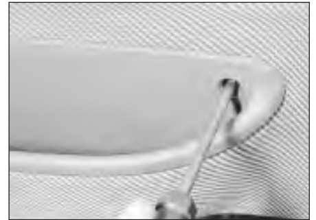
17.15b Trim panel securing screw at top edge of door pocket