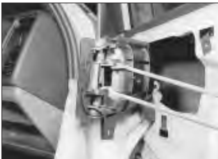
18.3b . . . and slide the handle assembly from the door aperture