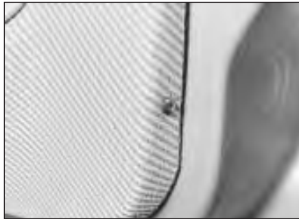
17.15a Trim panel securing screw at bottom rear edge of door

23 Lift the interior door handle, and withdraw the handle/ashtray surround.