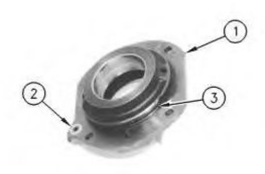
Illustration 6 g00906726