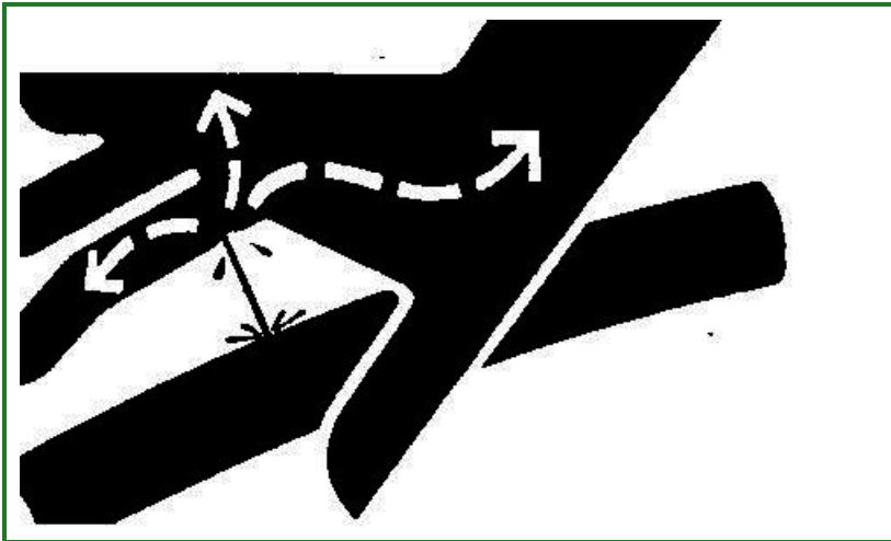
X9811-UN: Fluid Symbol

To avoid injury from escaping fluid under pressure, stop engine and relieve the pressure in the system before disconnecting or connecting hydraulic lines. Tighten all connections before applying pressure.