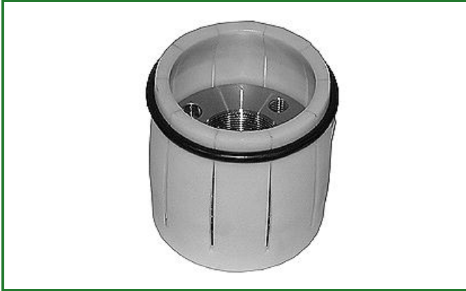
T116275B-UN: Compressing Piston Seal