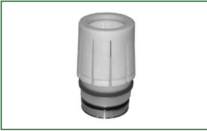
T116273B-UN: Installing Piston Seal