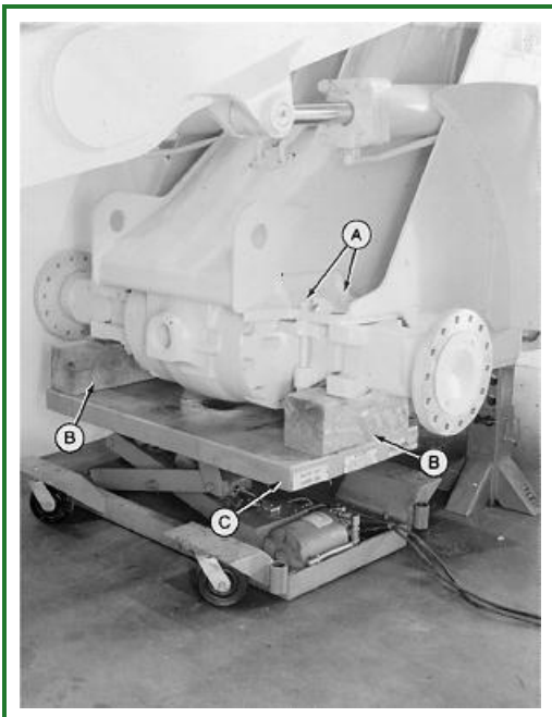
T6172BG-UN: Front Axle On Lift Table