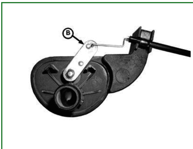
LV6675-UN: Fully Open Position