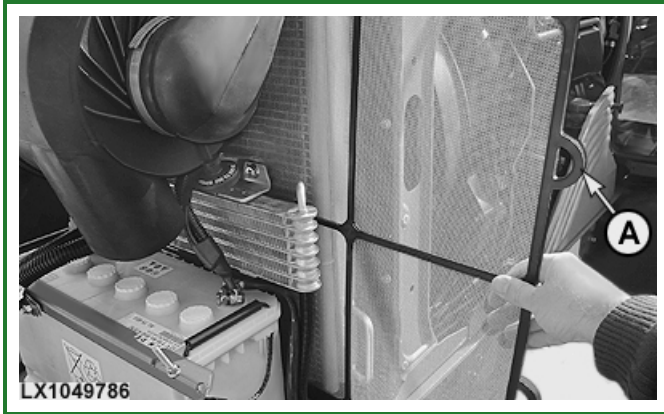
LX1049786-UN: Pull out screen