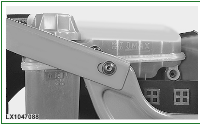
LX1047088-UN: Coolant level

If coolant temperature is too high, rectify the cause (dirty radiator, clogged screen, coolant level too low).