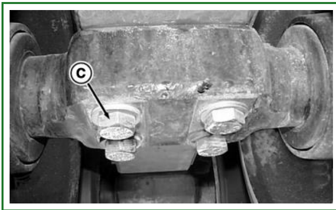
RXA0062630-UN: Mid-Roller Assembly Retaining Cap Screws