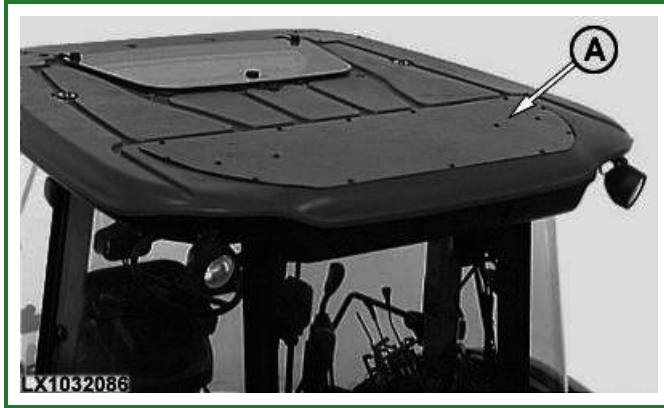
LX1032086-UN: Opening the radiator housing